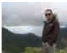
Head in the Clouds